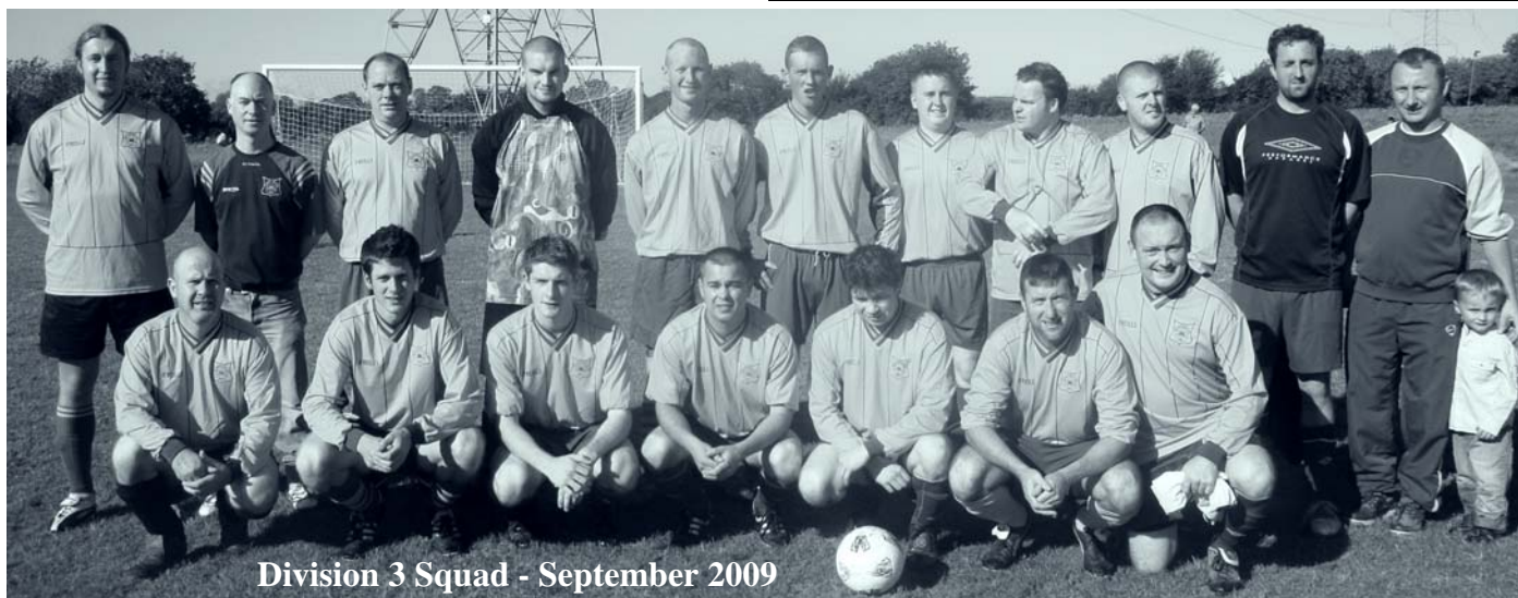
Division 3 Squad - September 2009