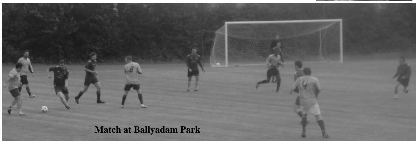
Match at Ballyadam Park