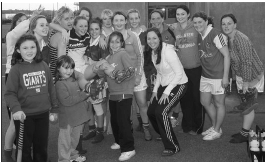
12 a side Ladies team

our bag packing event in Tesco Midleton and our Church Gate Collection in Carrigtwohill. An amazing 70 people or so volunteered their services for both collections – a true indication of the growth of the club. Both days again were very successful.