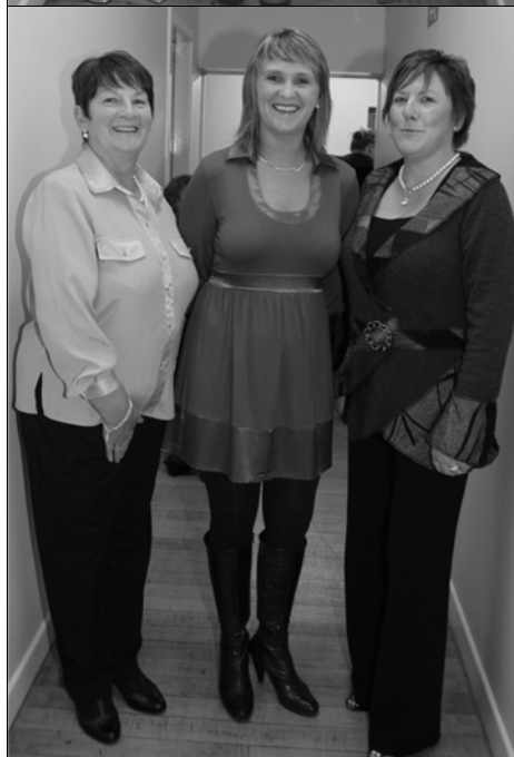
Some of the models at the fashion show