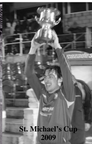
St. Michael's Cup 2009