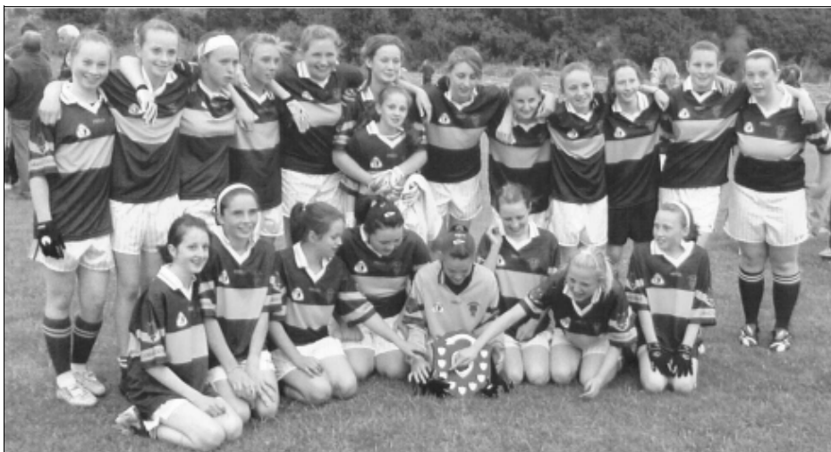
Under 14 East Cork League Winners