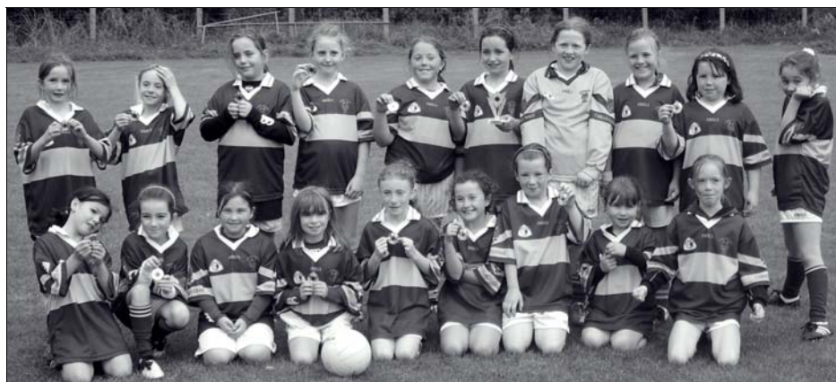
Under 9's team who won at Glanmire

Our next big event was not so glamorous but still very important, in June we had