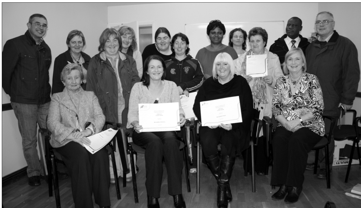
Group pictured at the presentation of FETAC Certificates for Child Care and Computers at the Taylor Centre in Carrigtwohill